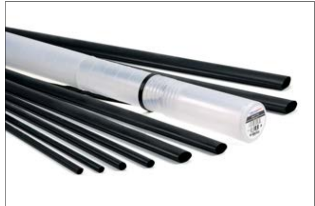
Heatshrink tubing MA47 in a handy, re-usable kit.