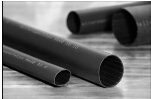
HA40 thick wall, adhesive lined and flame retarded tubing for shipbuilding applications.