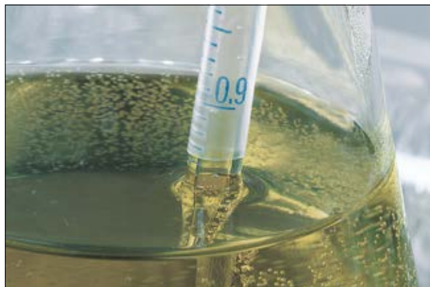
This thin walled, translucent heat shrink tubing is often used for chemical applications.