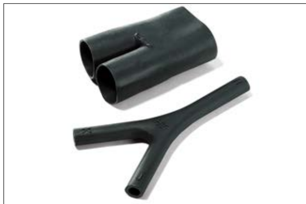
492H412-415 Series supplied / fully recovered.

For Material / Adhesive information please refer to page 272, 273.