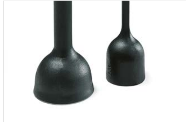
177-1-G as supplied / fully recovered.