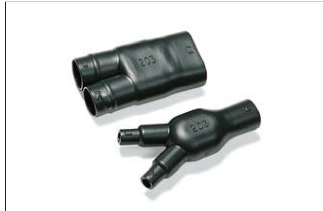
Two-way outlet shape 223-2 supplied / fully recovered.

For Material / Adhesive information please refer to page 272, 273.