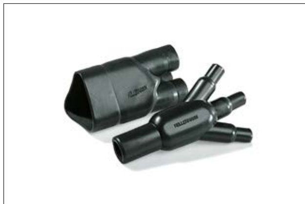
304-1-G supplied / fully recovered.