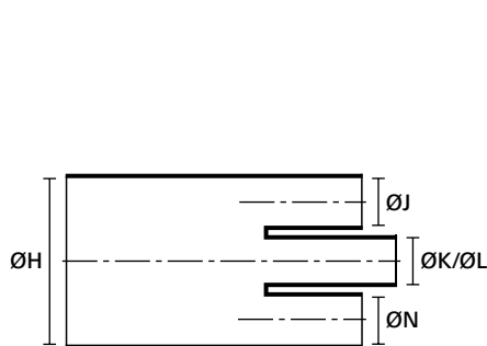
a: Expanded form (supplied)

For Material / Adhesive information please refer to page 272, 273.