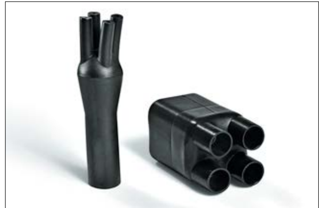
442-1 supplied / fully recovered.