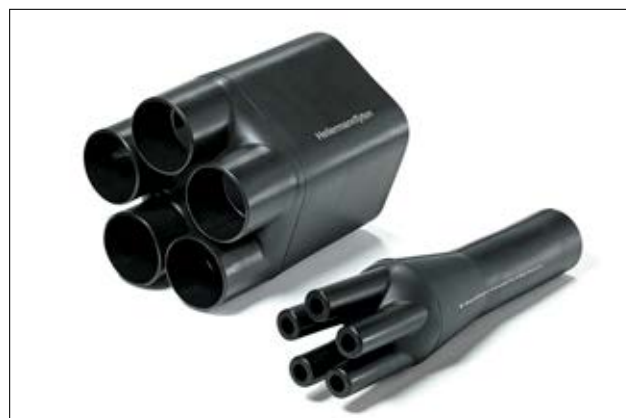
500 Series supplied / fully recovered.

For Material / Adhesive information please refer to page 272, 273.