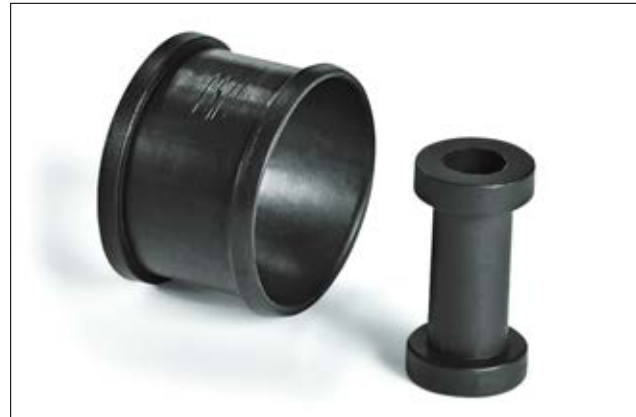
1793-1 supplied / fully recovered.