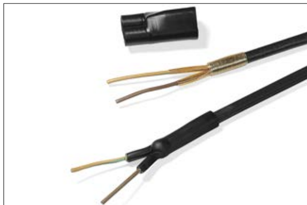
Adhesive tape HMT200A for sealing against humidity.