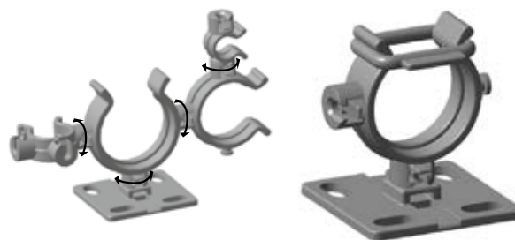
Multiple clips can be joined. Clips swivel freely.