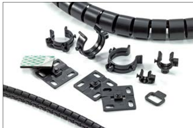
The Helawrap accessory set for bundling, fixing and protecting multiple cable runs.