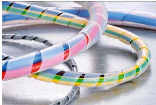
Spiral binding SBTFE - ideal for extreme conditions.