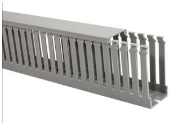
HelaDuct HTWD-PD - DIN sized wiring duct.