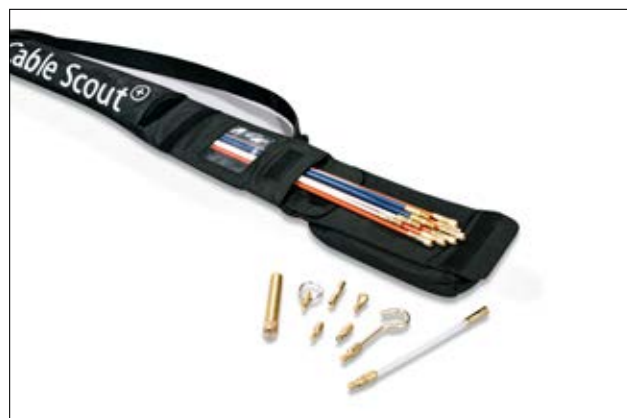
All components stored neat and tidy with the Cable Scout+ Deluxe set.