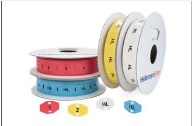
TAGPU diamond shaped form for easy application with only one cable tie.