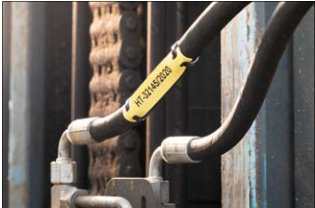
Cable marker for easy marking in tough environments.