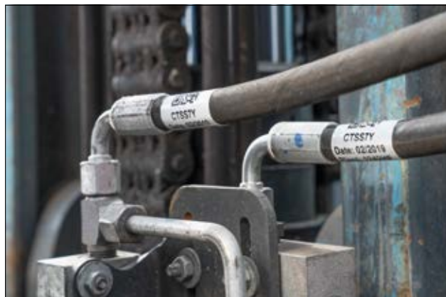
Helatag 1232 – self-laminating labels with good resistance to alcohol and hydraulic oils.