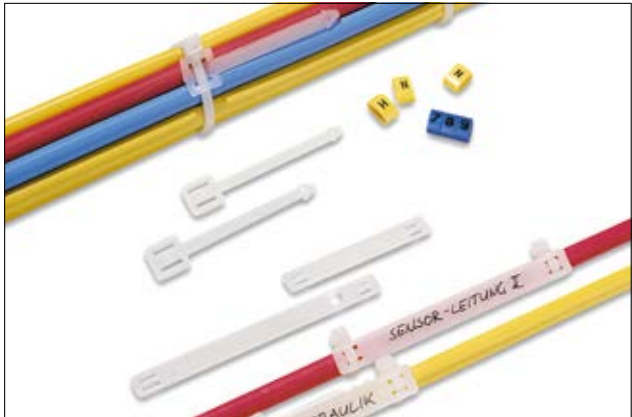
A clearly better way of identifying cables and pipes.