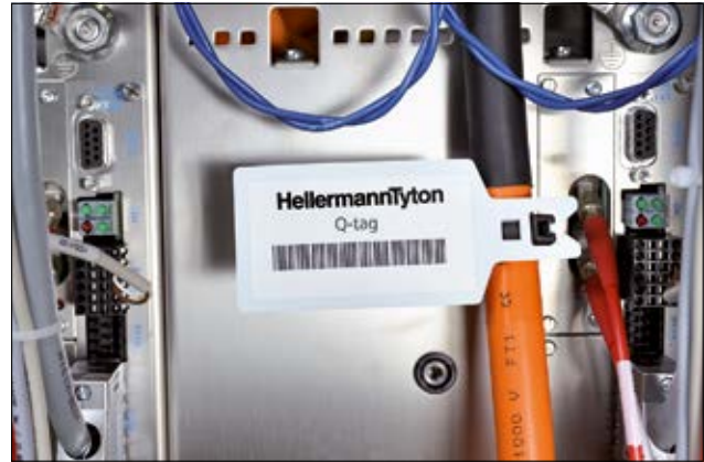
The flagged orientation of Q-tags ensures that printed texts are easily visible.