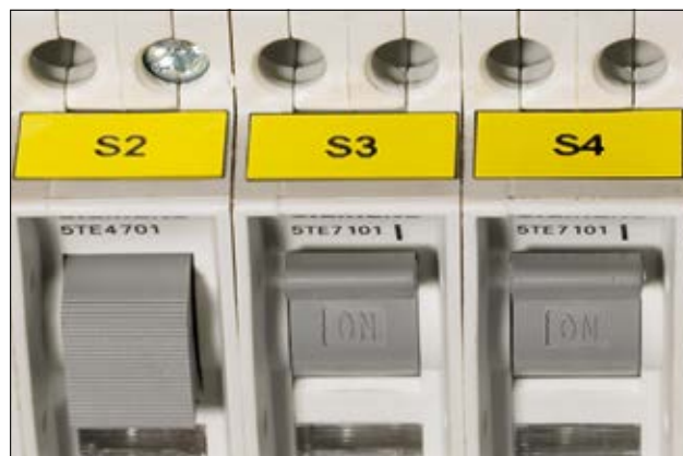
Clearly identified labels ensure easy network wire and cable management.