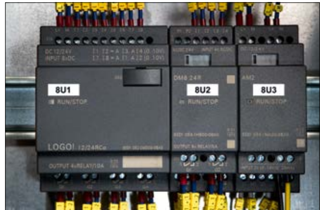
Clearly identified labels ensure easy network wire and cable management.