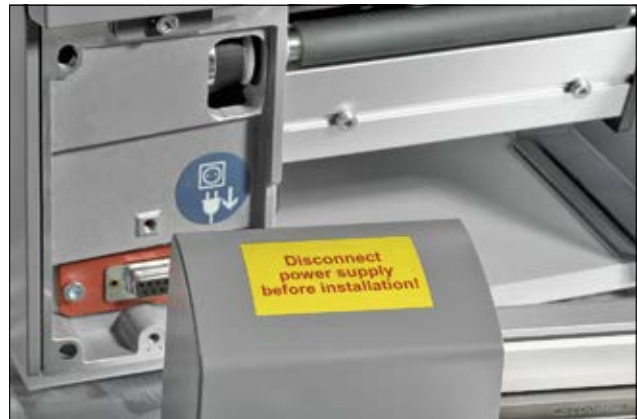
Optimal print results with a range of office laser printers.