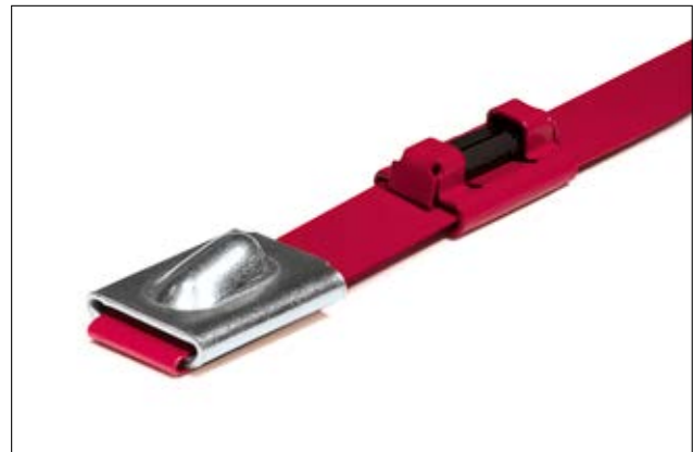
MBTRFID – stainless steel RFID cable ties for product identification in harsh environments.