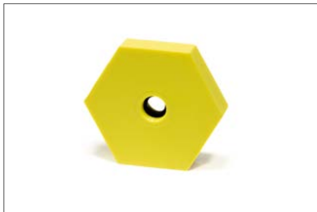
RFID HEXTAG – for applications where a RFID cable tie solution is not suitable.