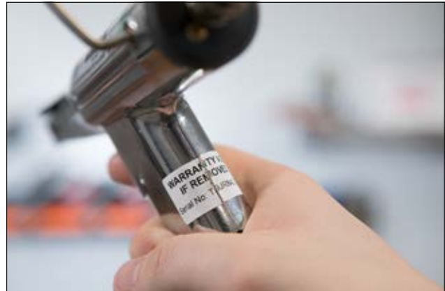
Helatag 1208 – a secure way of identifying if an asset label has been tampered with.