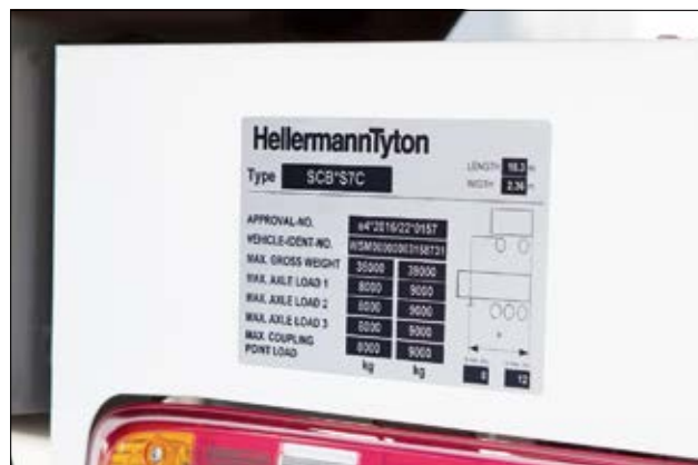
Type plate of an HGV trailer with protective laminate.