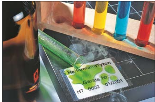
Helatag protective laminates.