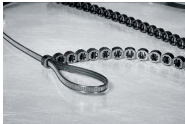
Closures and strap for ATS3080.