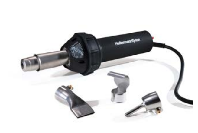
H6100 Electrical Hot Air Gun.

• Sturdy tool case incl. 3 push-on nozzles for precise heat shrink applications