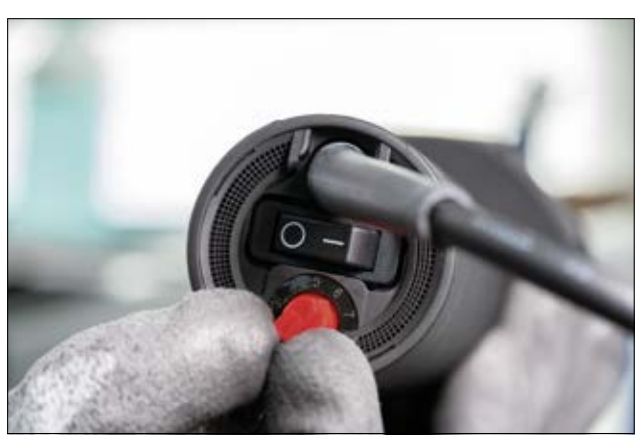
Adjusting H6100 operation temperature.