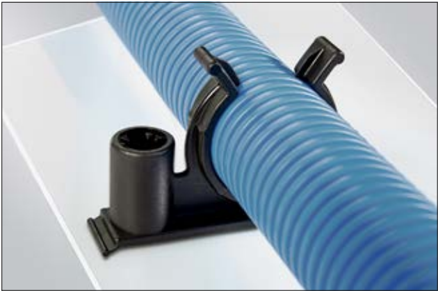
The tubing is clicked into the CTC clamp and is held firmly.