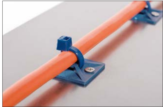
Detectable fixing solution containing of MCMB mount and MCT cable tie.