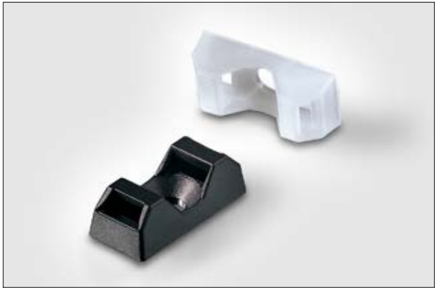
Q-Mount, CTQM 2-way entry, screwable.