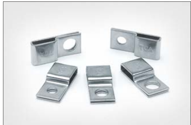
Stainless Steel P-Mount SSPC for use in arduous environments.

Material specification please see page 26.