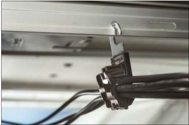
Ratchet P-Clamp Hanger applied to a solar panel.