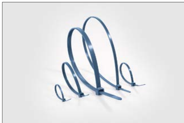
MCTPP ties have a high chemical and temperature resistance.