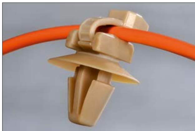
PEEK fixing ties can be used for small diameters from 1,0 mm.