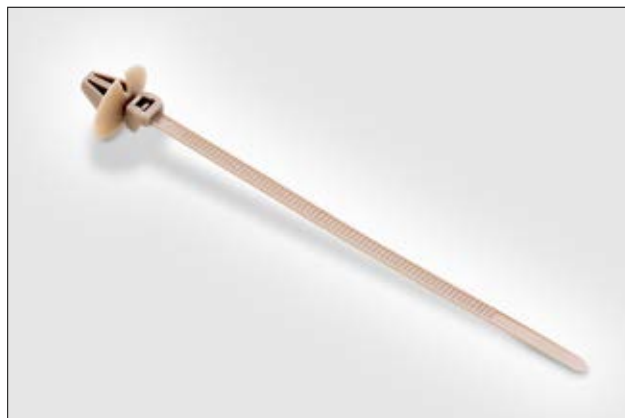
One piece fixing tie with arrowhead, outside serrated.