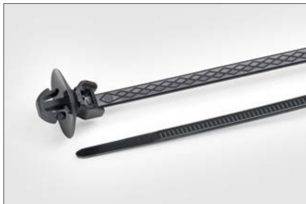
T30SOS-AS-SFT6.5x4E, 1 piece fixing tie with AntiSlip engraving and for an round hole 6.5 mm or an square hole 6.5x4 mm.