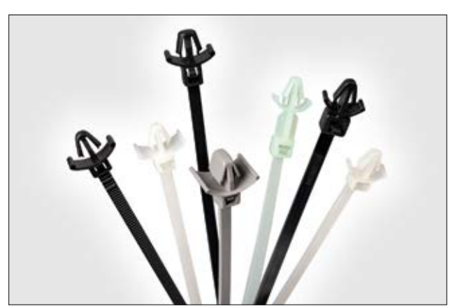
A wide range of arrowhead fixing ties which are suitable for different panel thicknesses and hole diameters.