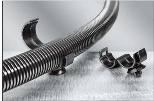
Simple and secure installation of pipes or hoses to panels.