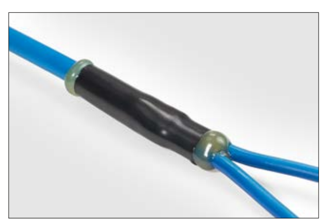
TA46 - Environmental sealing, insulating and protecting inline wire splices.