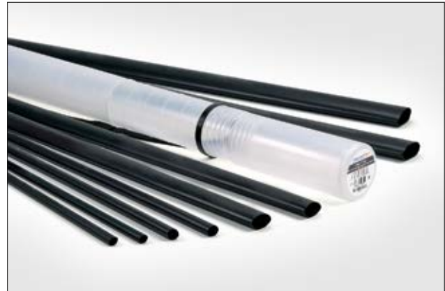
Heatshrink tubing MA47 in a handy, re-usable kit.