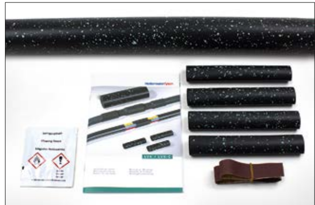
LVK: Outer sleeve, inner sleeves, cleaning cloth, emery cloth, installation instructions.