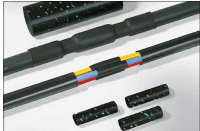
LVK - Heat shrinkable straight-through joint.