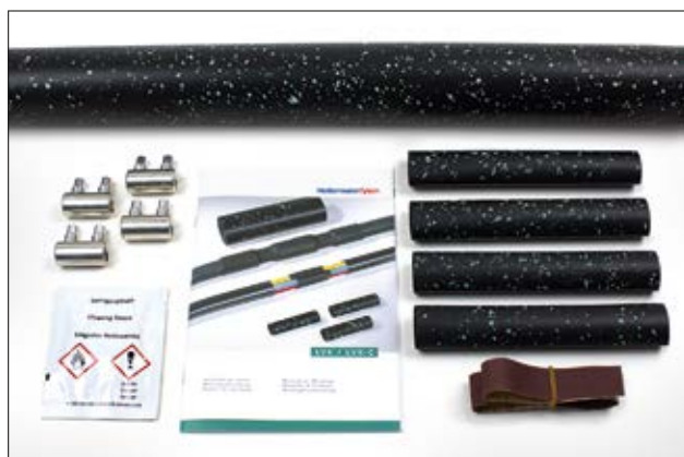
LVK-C: Outer sleeve, inner sleeves, mechanical connectors, cleaning cloth, emery cloth, installation instructions.