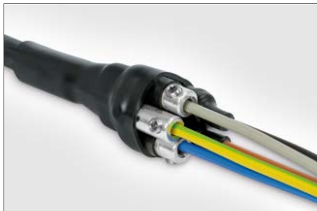
LVK-C - Heat shrinkable straight-through joint with connectors.