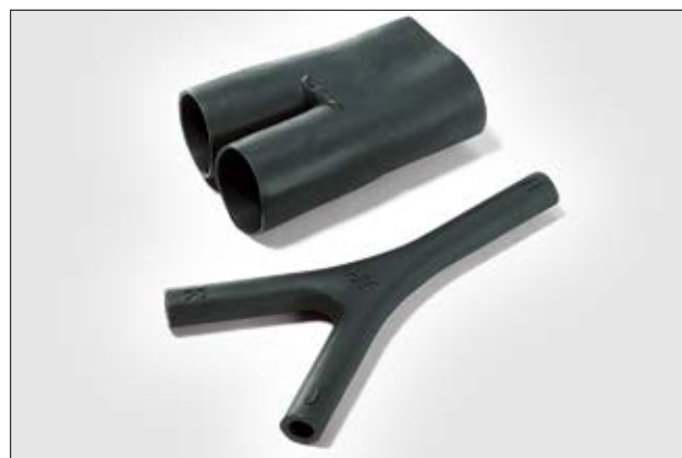
492H412-415 Series supplied / fully recovered.

For Material / Adhesive information please refer to page 274, 275.