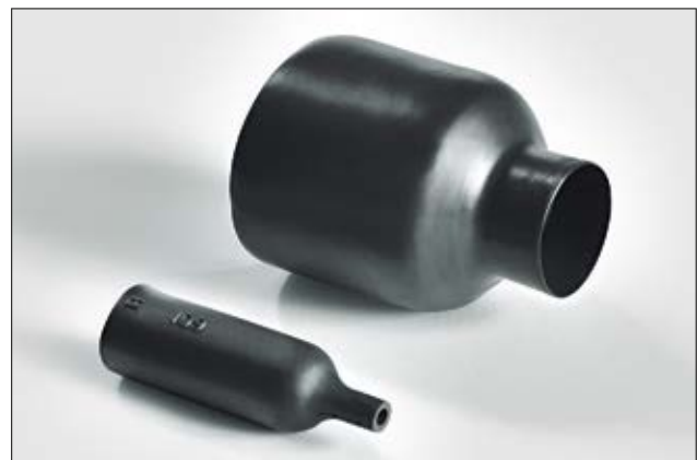
100 series supplied / fully recovered.