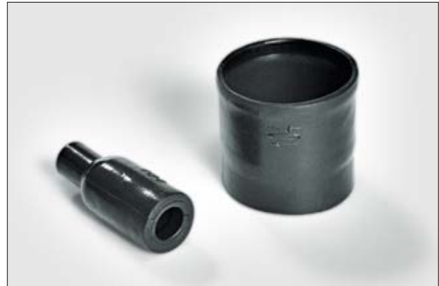
100 series supplied / fully recovered.