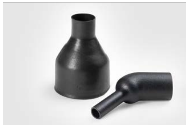
1837-5 supplied / fully recovered.

For Material / Adhesive information please refer to page 274, 275.