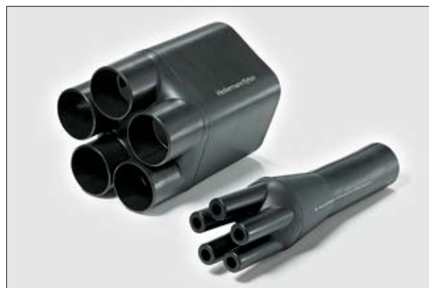
500 Series supplied / fully recovered.

For Material / Adhesive information please refer to page 274, 275.