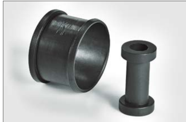
1793-1 supplied / fully recovered.