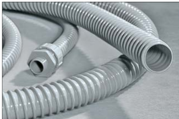
PSR is extremely flexible and allows for easy insertion of cables.