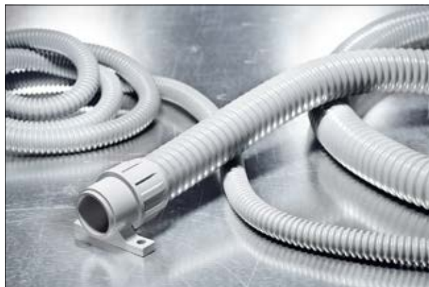
FlexiGuard FG with FG-UH fitting.